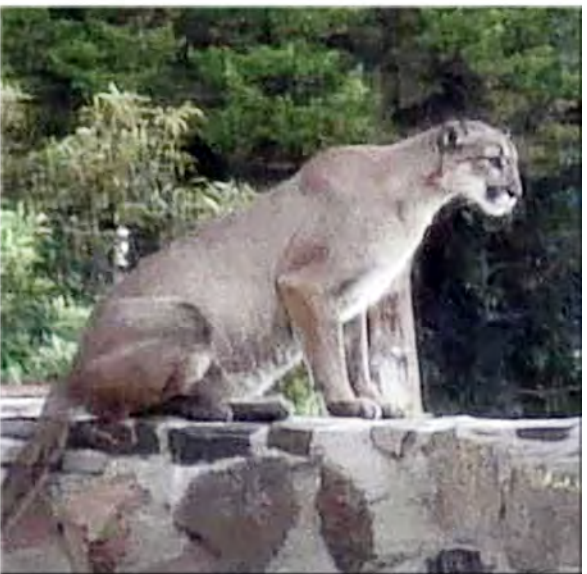
posted on Ring Neighbors on Gitana in Country Club Village the same morning