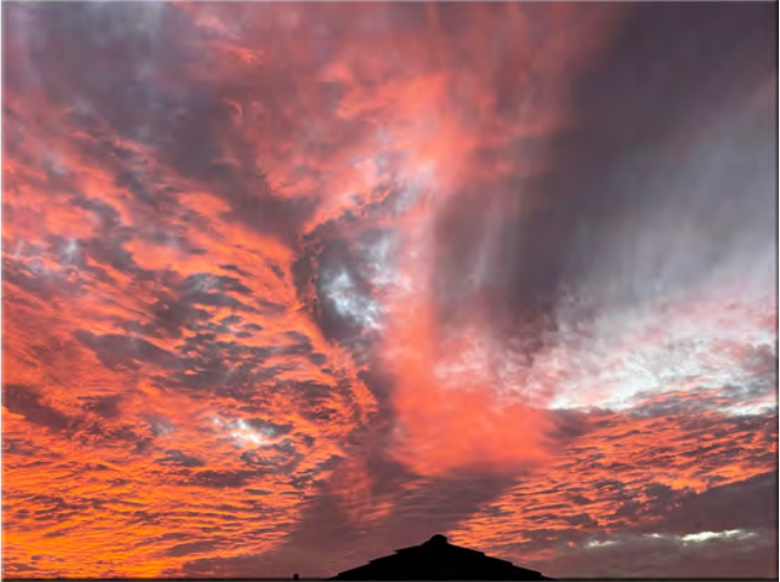
Our incredible cloud formations and sunsets, captured so well by Lorraine Villarreal.